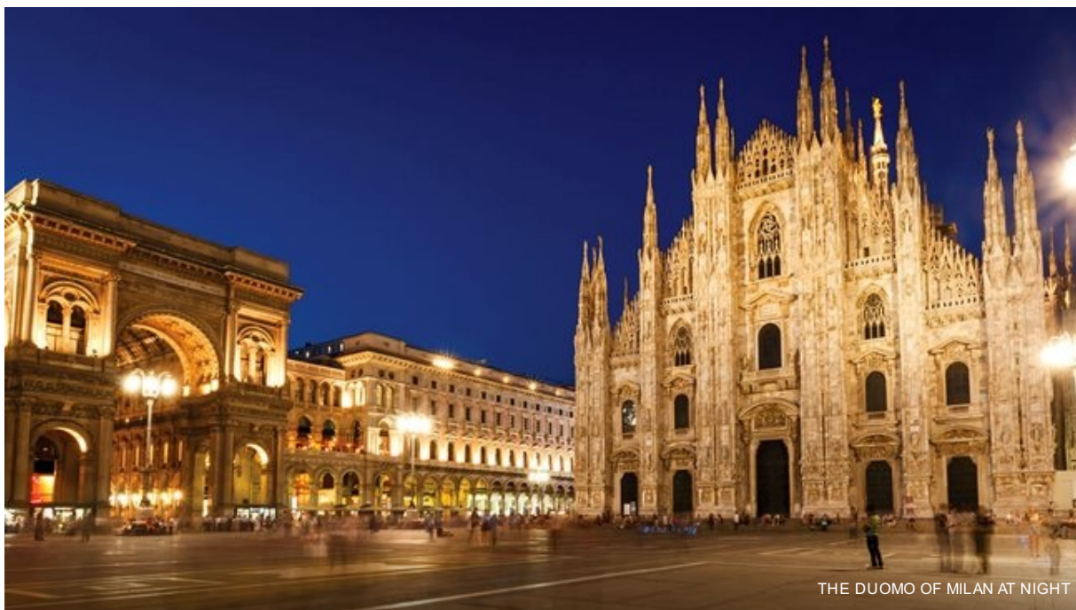
THE DUOMO OF MILAN AT NIGHT

Overnight in Milan at the Starhotels Ritz or similar.