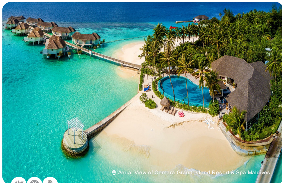
📍 Aerial View of Centara Grand Island Resort & Spa Maldives