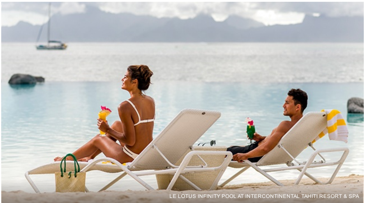
LE LOTUS INFINITY POOL AT INTERCONTINENTAL TAHITI RESORT & SPA