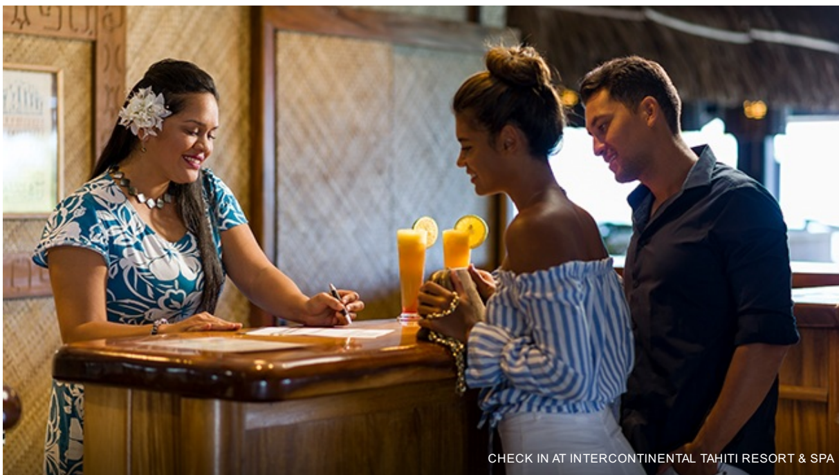
CHECK IN AT INTERCONTINENTAL TAHITI RESORT & SPA

Overnight stay in Tahiti at InterContinental Tahiti Resort & Spa in a Classic Garden View Room.