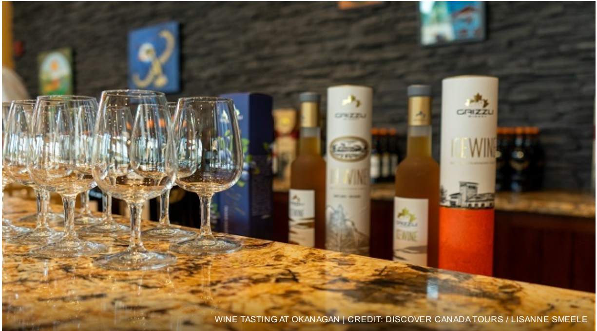
WINE TASTING AT OKANAGAN