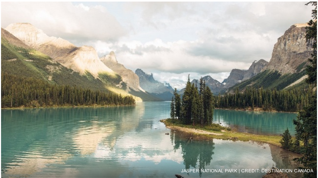
JASPER NATIONAL PARK