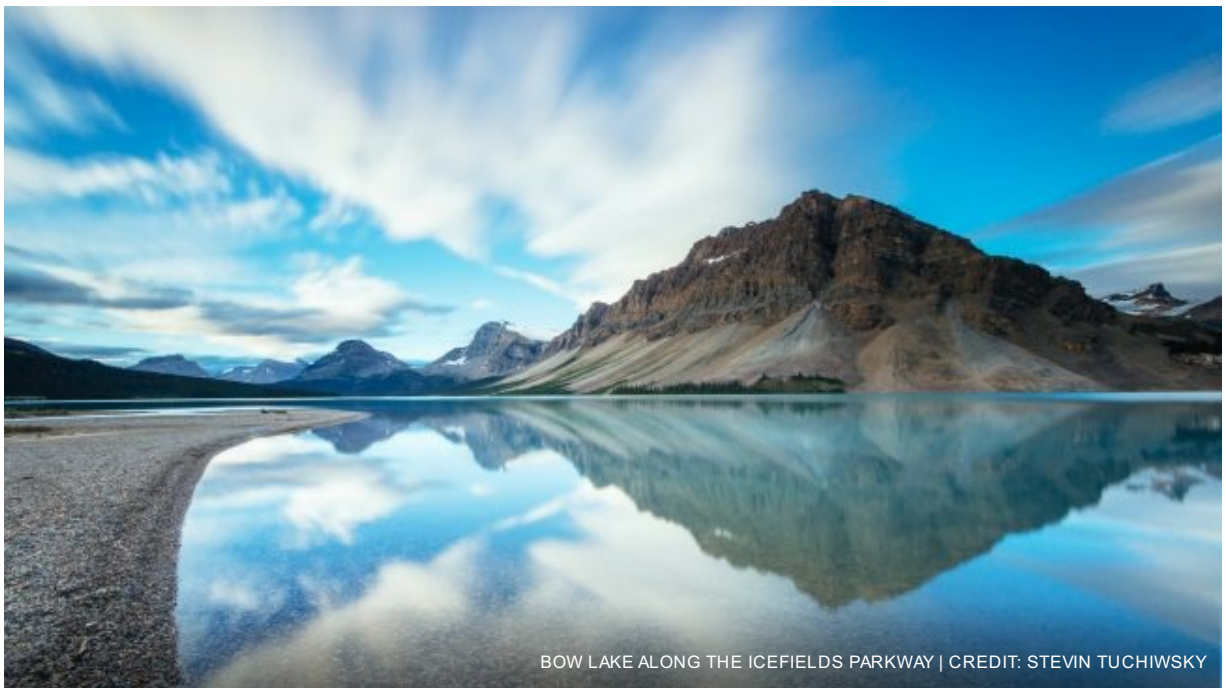
BOW LAKE ALONG THE ICEFIELDS PARKWAY