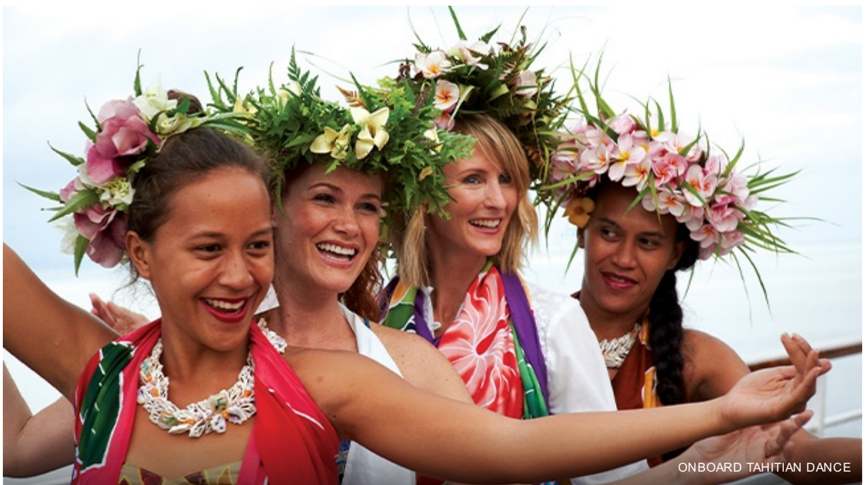
ONBOARD TAHITIAN DANCE