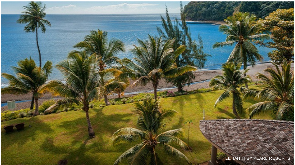
LE TAHITI BY PEARL RESORTS