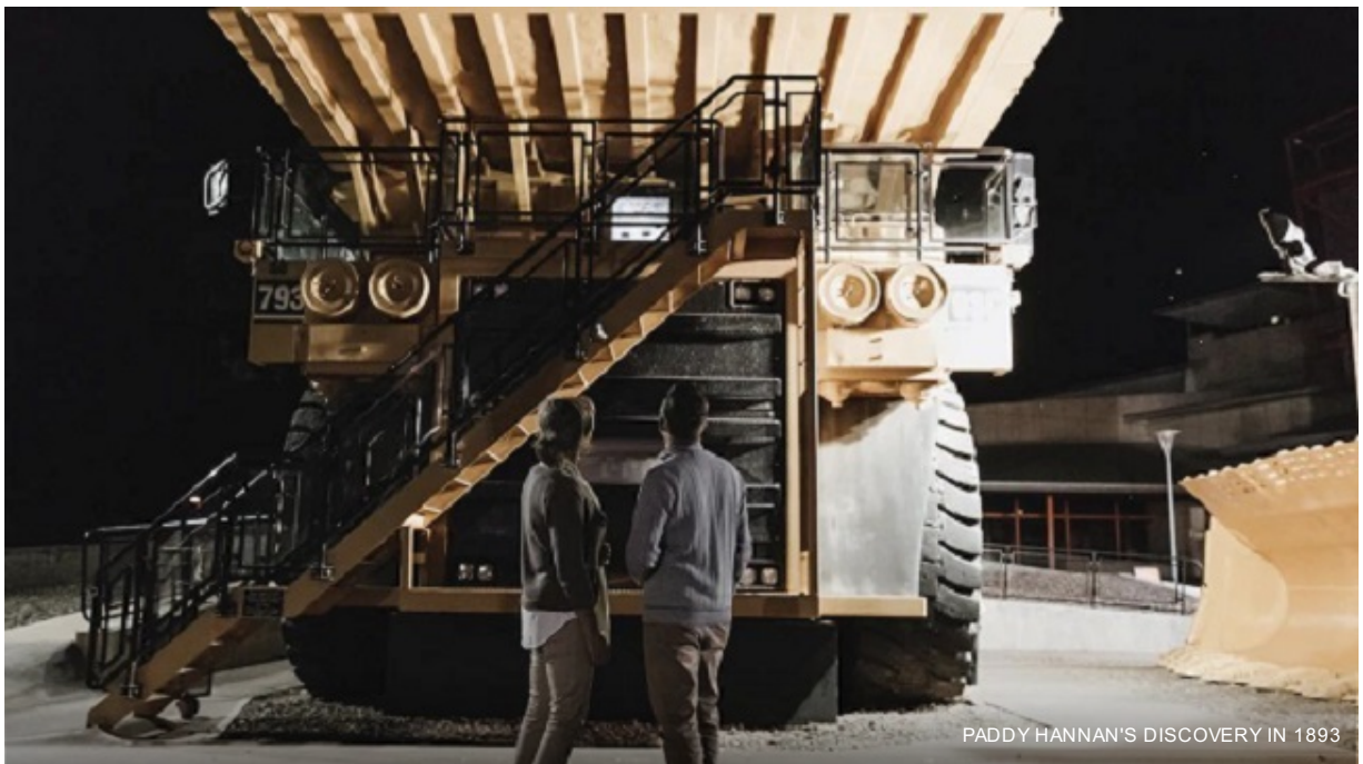
PADDY HANNAN'S DISCOVERY IN 1893