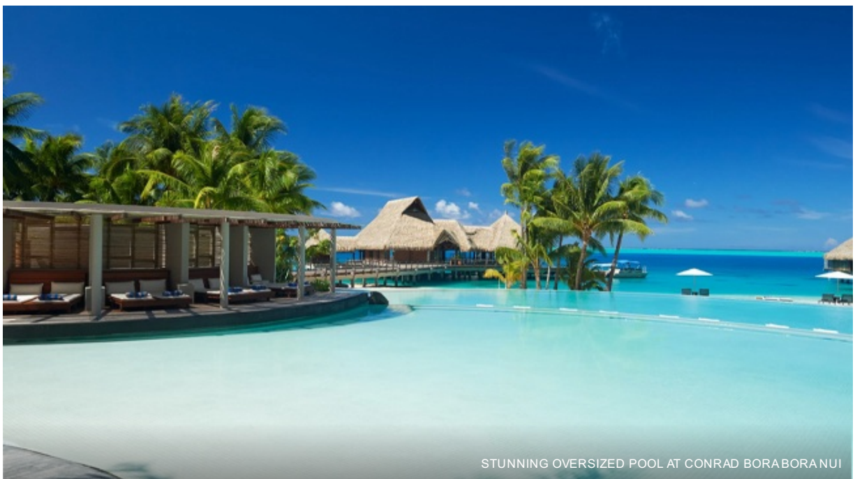
STUNNING OVERSIZED POOL AT CONRAD BORABORANUI