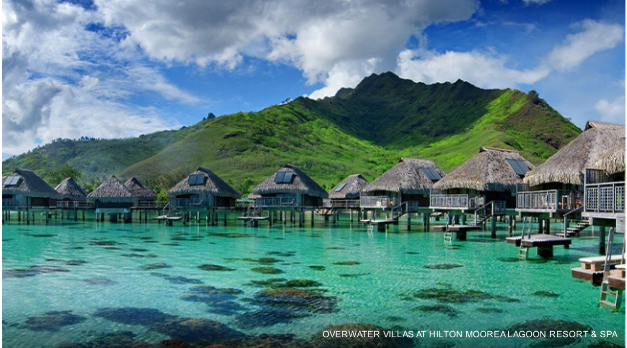
OVERWATER VILLAS AT HILTON MOOREA LAGOON RESORT & SPA

Overnight stay in Moorea at Hilton Moorea Lagoon Resort & Spa in a Garden Pool Bungalow.