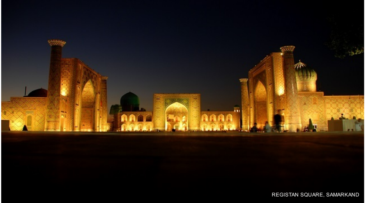
REGISTAN SQUARE, SAMARKAND