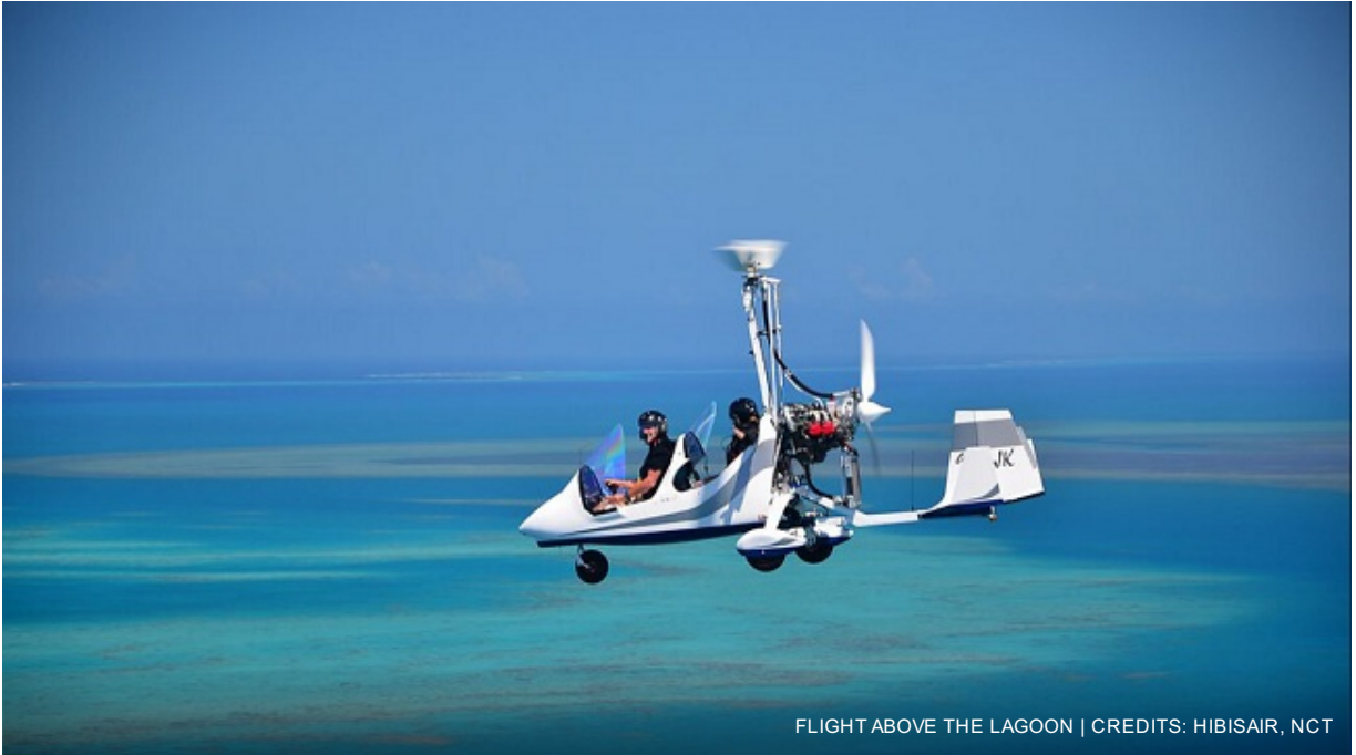
FLIGHT ABOVE THE LAGOON