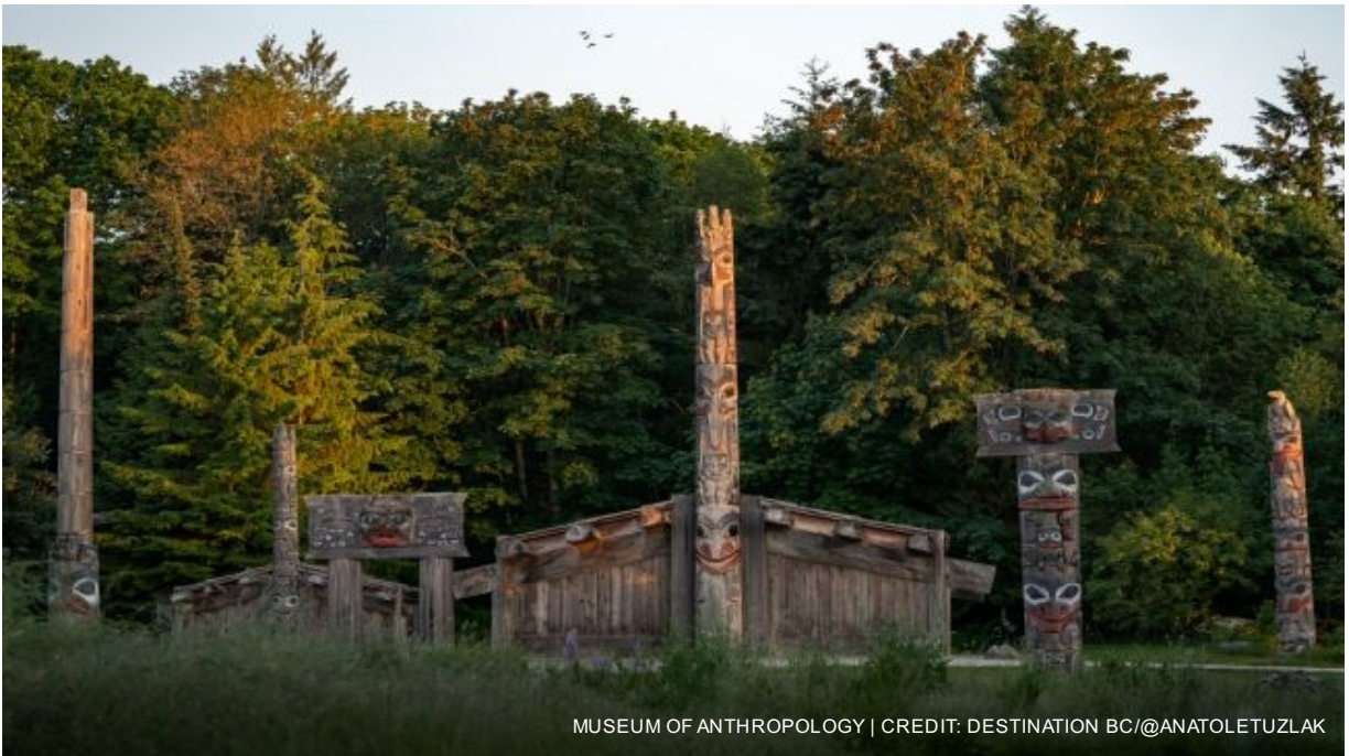
MUSEUM OF ANTHROPOLOGY

Overnight in Vancouver at the L'Hermitage Hotel